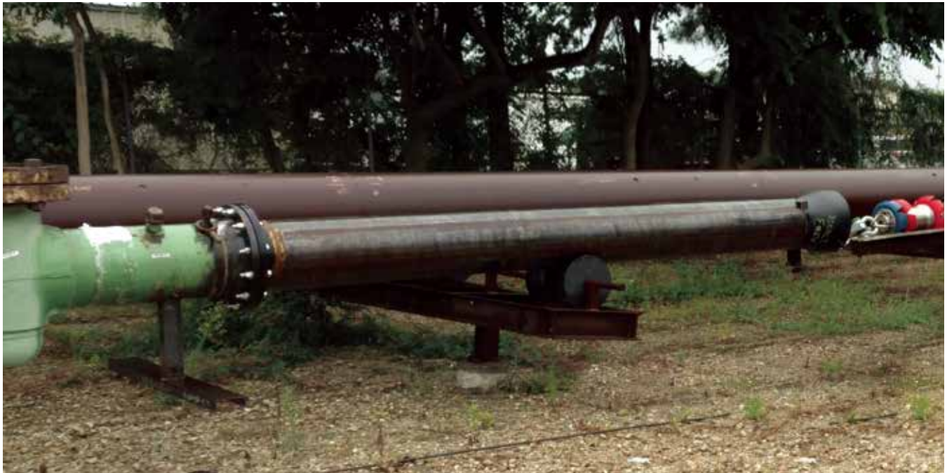
Figure 1 - Newly redesigned Pig-Plug line stopper insert successfully passing rigorous third-party testing

For more information about us, or to view our full line of products, please visit www.muellergas.com or call: 1.800.798.3131.